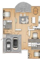
Lot & House Ridge Project