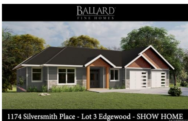
1174 Silversmith Place - Lot 3 Edgewood - SHOW HOME

MLS® No: 892033 List Price: $1,349,000 Status: Active Original Price: $1,299,000 DOM: 7 Sold Price: List Date: 2022-01-05 Pending Date: Area: Comox Valley Sub Area: CV Comox (Town of) Sub Type: Single Family Detached Baths: 3 Beds: 4 Fireplaces: 1 Kitchens: 1 Lot SqFt: 6,996 Parking: 2 Lot Acres: 0.16 Fin SqFt: 2,988 Unfin SqFt: 0 Title: Freehold Storesys: Strata Fee: Year Built (Est): 2021 Taxes: $1,641 Tax Year: 2021